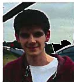
Alex Whitehouse Solo Cross Country

*Apologies photographs unavailable at time of going to press