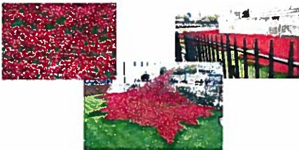
Poppies in situ

This year has seen an increase in our London sightseeing trips with a special emphasis on the 'Poppies' at the Tower of London. As you will all agree by air or by foot they were quite spectacular!