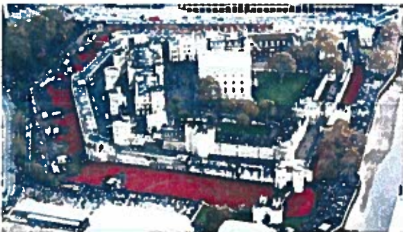
Aerial shot as the Poppies are being removed

Please visit the EBG Facebook page for further photographs https://www.facebook.com/pages/EBG-Helicopters/815270795280625